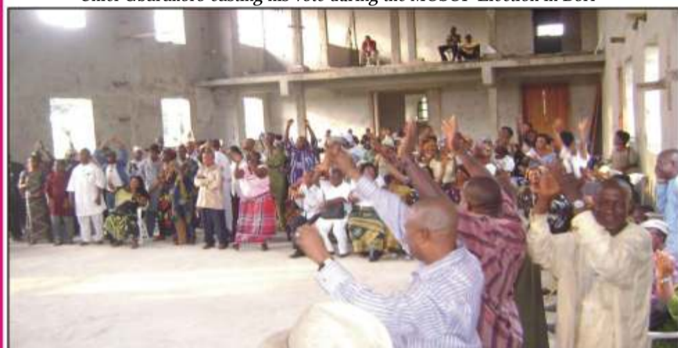
Cross section of Ogoni voters, declaring the President unopposed