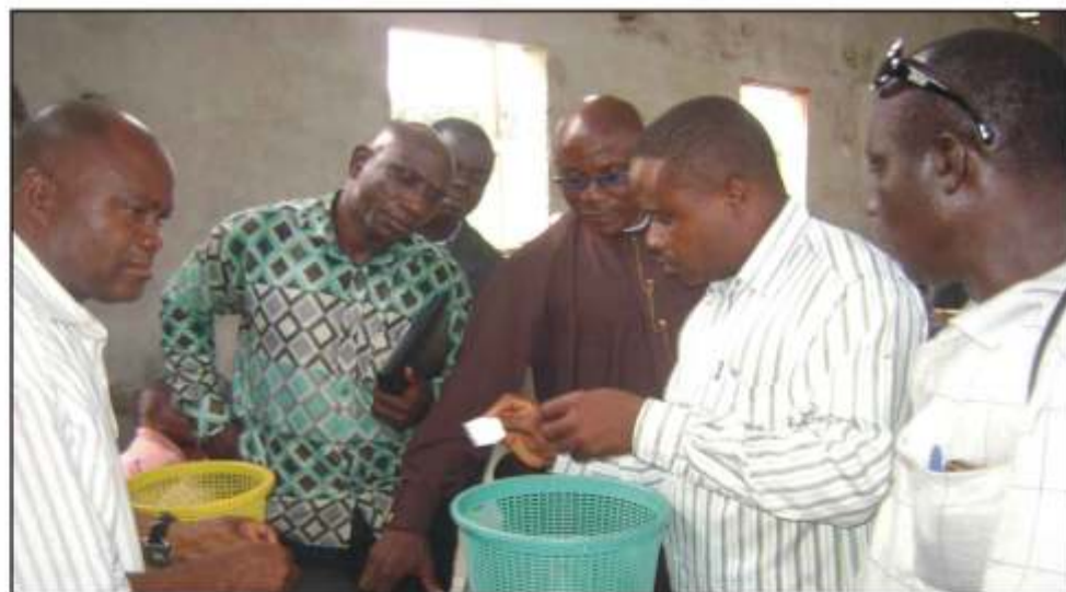
Contestants for Office of MOSOP Sec. Gen, and some Election officials confirming votes