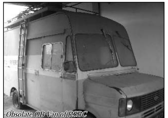
Obsolete OB Van of RSBC

Outlining the pathetic problems of her station to the Special Adviser, Ms Tador said if nothing urgent is done the RSBC will not meet up the NBC 4-year deadline to digitalize as all the equipment in use are all analogue. She also pleaded for government intervention in the areas of security and accommodation, as the station inherited from the NBC about 27 years ago is completely dilapidated, lacks modern requirements and standards for modern