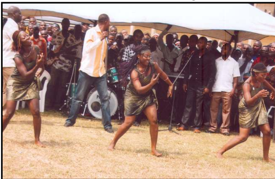
Ogoni Artistes, dance group