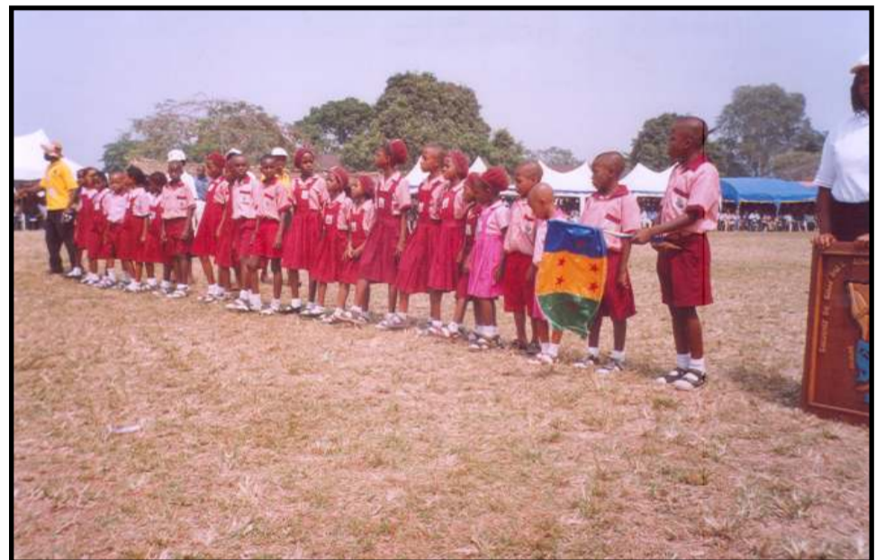
Pupils of Bebor Int'l School Bodo making their presentation