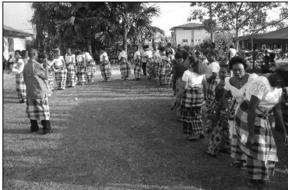
Ogoni Women residents in Bayelsa State dancing during their end of Year Celebration in Yenagoa recently

He said the association had acknowledged some challenges that included the lack of a permanent office accommodation, employment of members and shuttle bus to ease mobility, of the associations executives.