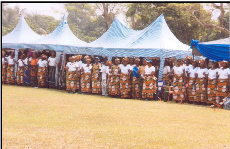
Cross Section of FOWA Members (Ogoni Women)