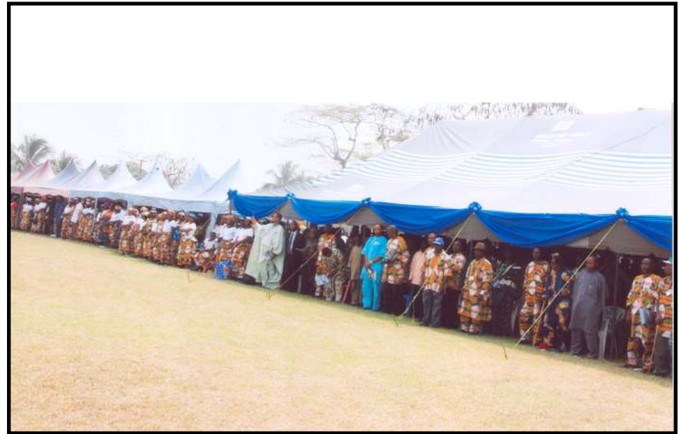
Cross Section of Participants at the occasion