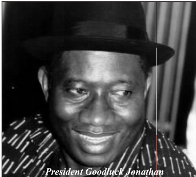
President Goodluck Jonathan