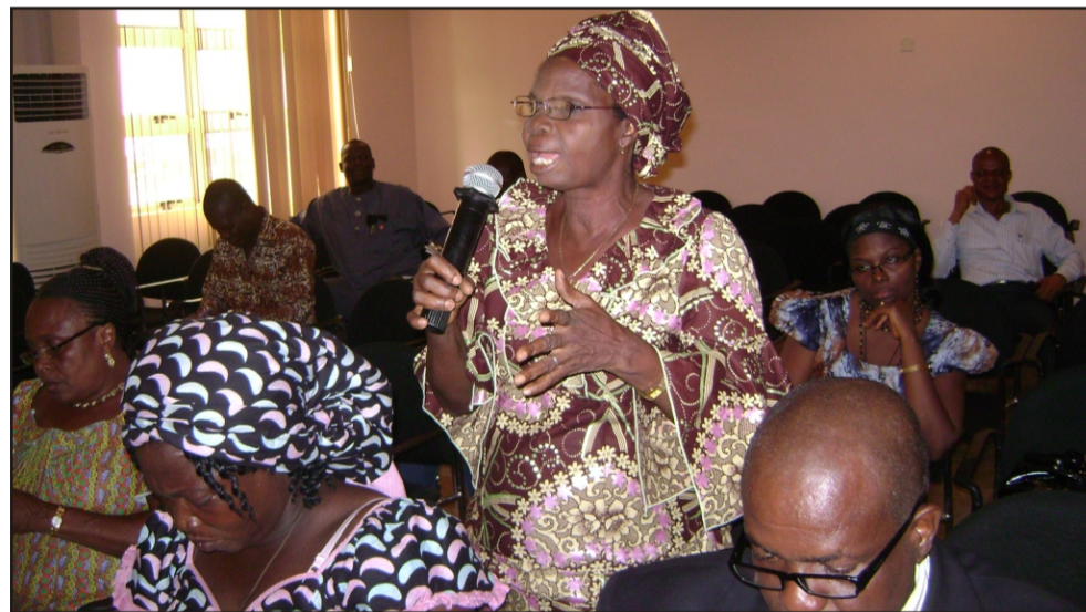
A Participant making contribution at the Conference