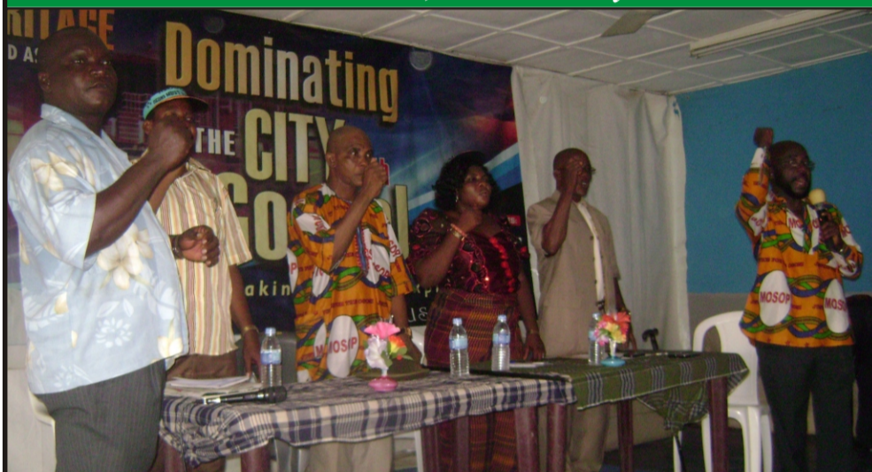
Some Key MOSOP Officials singing the Ogoni anthem at the MOSOP Inter-Kingdom meeting in Ebu, Eleme

Pictures below are scenes at MOSOP Inter-Kingdom Meeting held at Ebu, Eleme recently