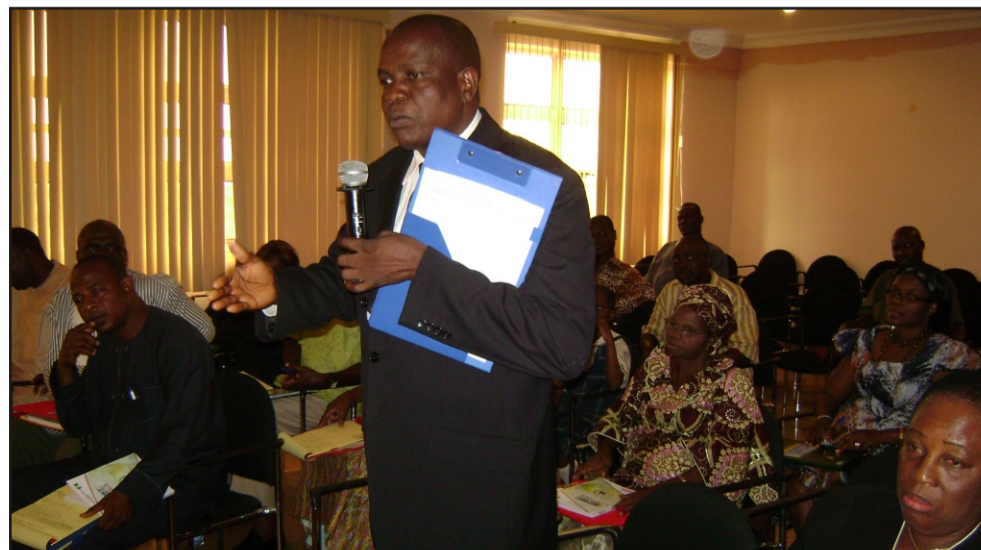
A Participant making contribution at the Conference