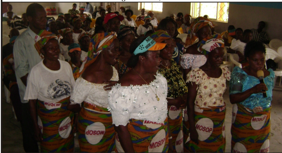
FOWA Group making a presentation at the MOSOP Inter-Kingdom Meeting at Ebu, Eleme