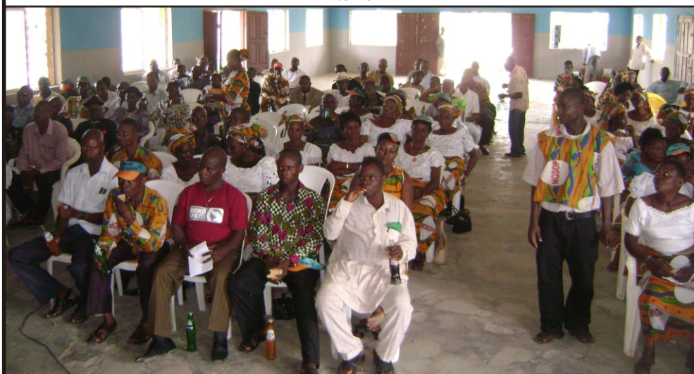
Cross Section of participants at the MOSOP Inter-Kingdom Meeting at Ebu, Eleme