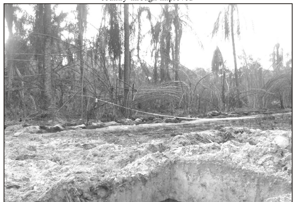
Devastating site of a recent Oil Spill in Gokana, Ogoni Land