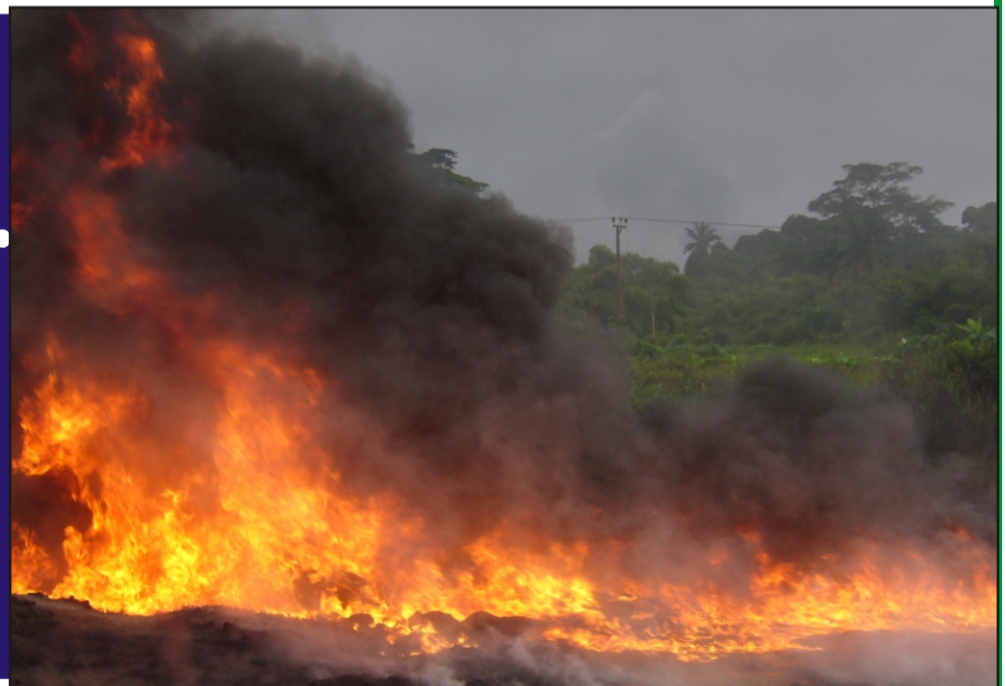
Recent Oil Pipeline Fire in Gokana, Ogoniland

Shell Soldiers Murder Another Ogoni Youth - MOSOP Faults JTF Claim