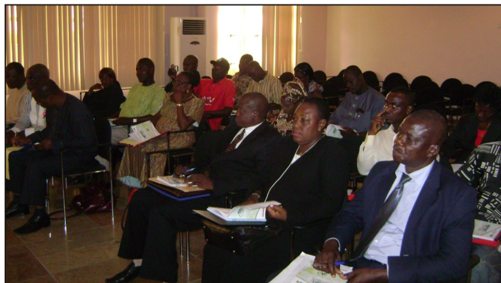
A Cross Section of participants at the Ethnic Nationalities Conference